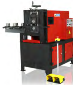
IRON EMBOSSING MACHINES