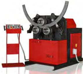
SECTION BENDING MACHINES