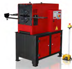
END WROUGHT IRON MACHINES