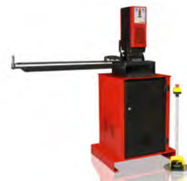
PRESSES FOR LOCKS