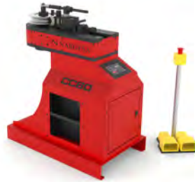
NON-MANDREL PIPE BENDER