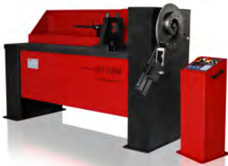
TWISTING/SCROLL BENDING MACHINES