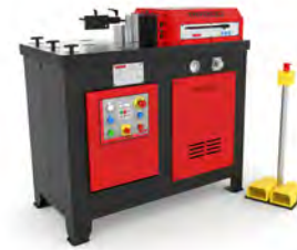
HORIZONTAL PRESS BRAKES