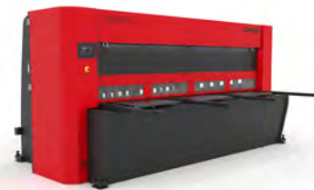
HYDRAULIC SHEAR MACHINES