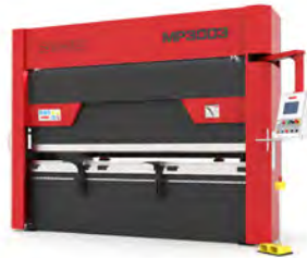
HYDRAULIC PRESS BRAKES